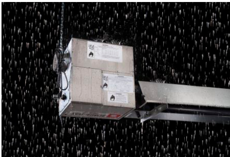
IP55 rated Stainless Steel burner box and fan